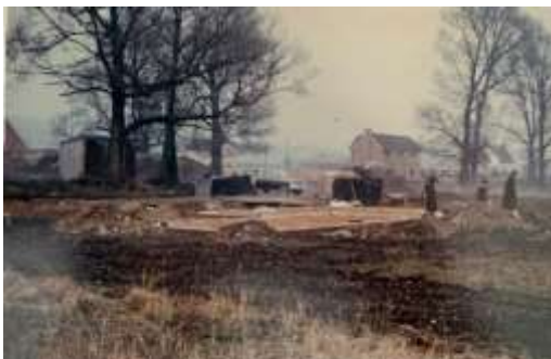
Construction of The Croft

1963 Behind the Village Hall the Duke of Newcastle Estate established The Croft with 28 houses which included 4 in Netton Street. In the middle of Netton Street was Croft Cottage, which remains today. This is where the drowner lived, whose job it was to lift up the hatches to let the water into all the meadows on the south side of the river.