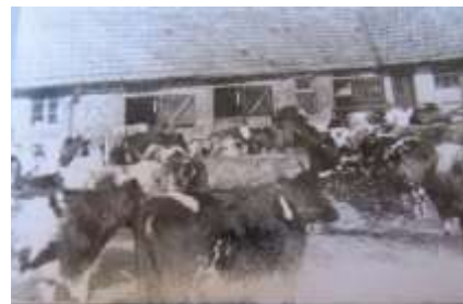
Dairy cattle at Crouchston

All the men who worked in the dairies lived in tied farm cottages. They would cycle or walk to the Village Hall for their entertainment. The Hall was used mostly by the men who worked on the farms – in the back room there was a snooker table, dart board and many games of cards were played there. A badminton court was marked out in the main room, which was regularly used, and outside there was a tennis court in what is now the car park.