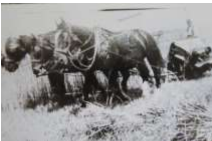
A group of horses pulling a wagon

Farming was very different from the present day. There were 8 farms with dairies; now we have lost all the dairies. The farms north of the river were Manor Farm, Whitlock Dairy, Netton and Flamstone. On the south side were South Farm, Faulston, Crouchston and Throope.